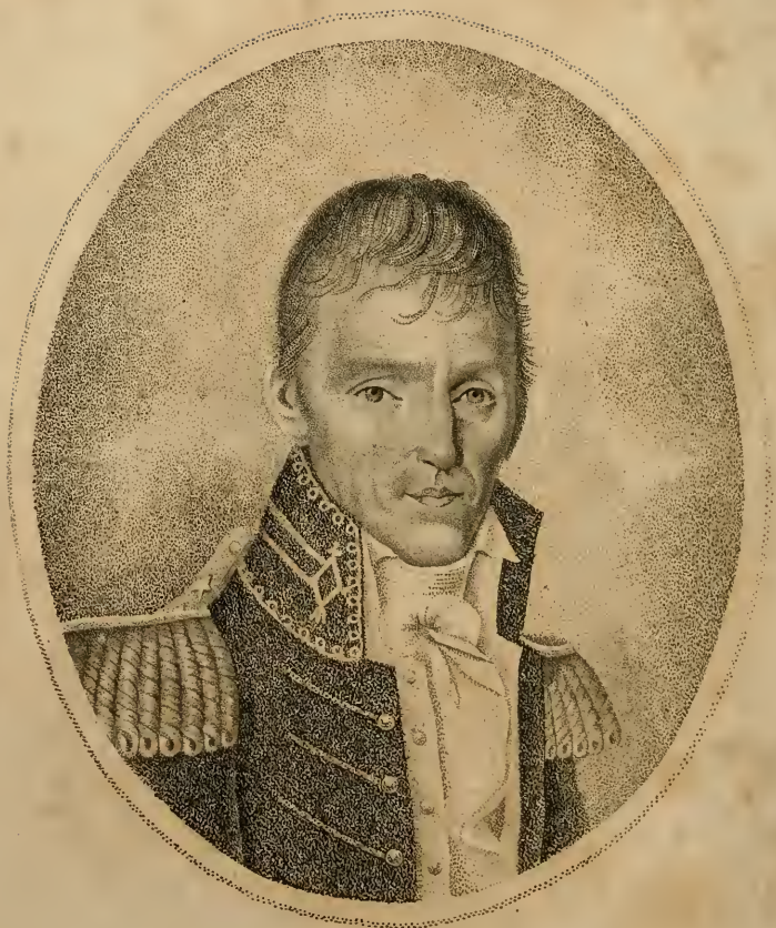
MAJ. R GEN. AL ANDREW JACKSON